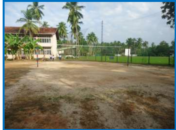
A new volleyball court was built by the FoG at the Sri Wimalabuddhi Maha Vidyalaya, Seenigama