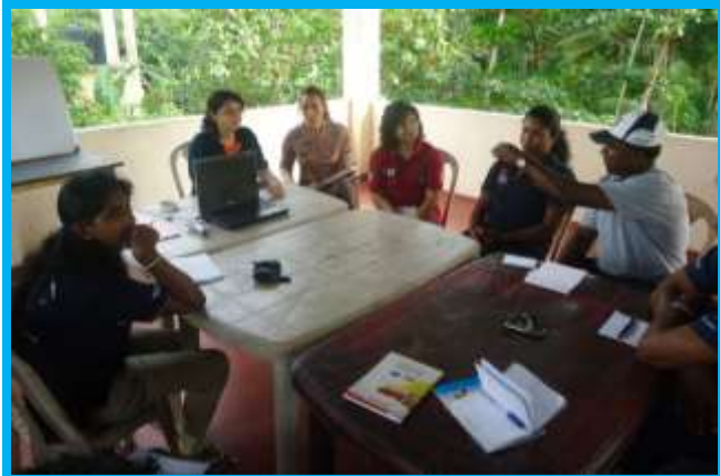
The RLP Team conducted a 'Sports Psychology' workshop with the Sports Academy staff